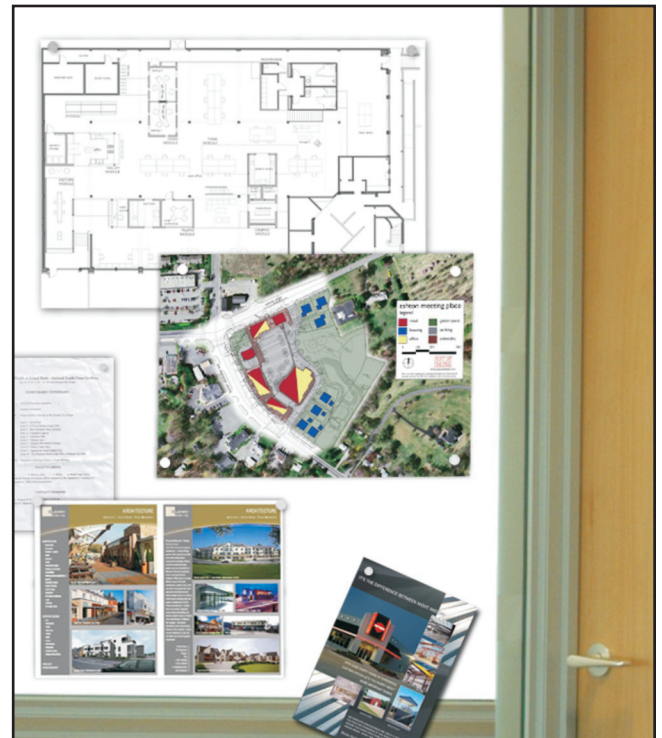
Part of an office wall covered with Magnetic Wallpaper